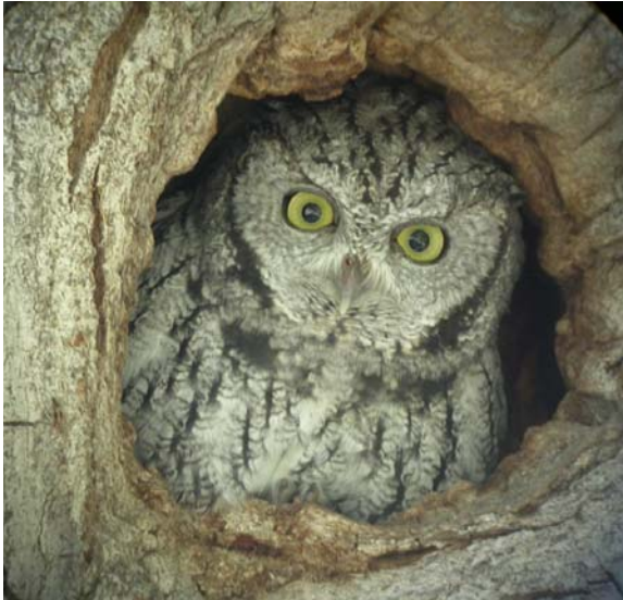
Western Screech Owl