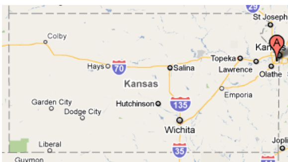
Overland Park KS